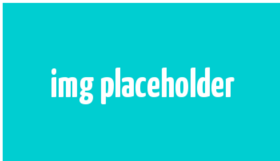
Figure 2.1: High-level diagram of Remote Access System

Here is a high-level diagram of the remote access system.